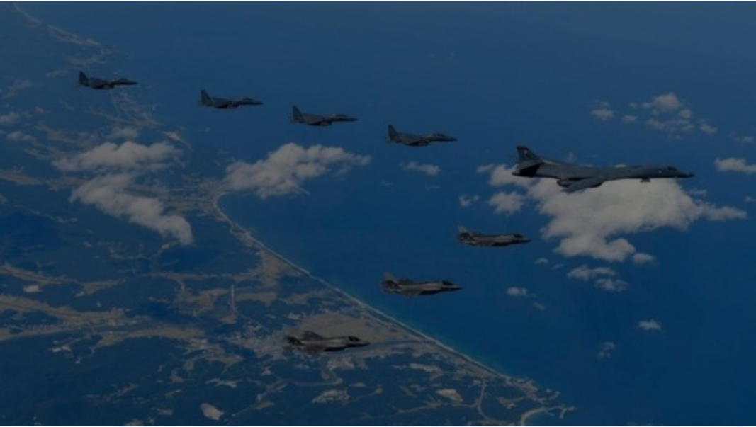
VIDEO: A US Air Force B-1B bomber, F-35B stealth fighter jets, and South Korean F-15K fighter jets fly over the peninsula.

'You are worse than I am': Transcript of Trump-Turnbull phone call leaked