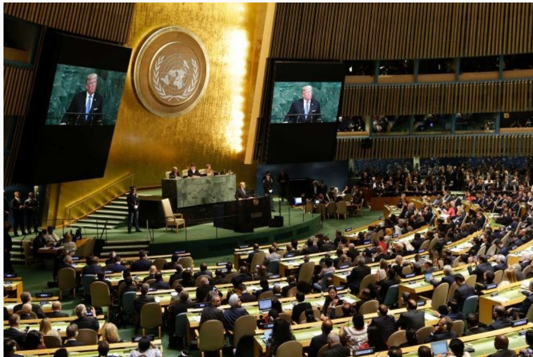
PHOTO: Mr Trump addressed 193 diplomats at the UN General Assembly's New York headquarters. (AP: Seth Wenig)

In a thunderous 41-minute speech, Mr Trump also took aim at Iran's nuclear ambitions and regional influence , Venezuela's collapsing democracy, and the threat of Islamist extremists. He also criticised the Cuban Government.